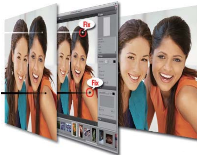
Auto record and remove Hot/Dead pixels

PhotoStudio Darkroom automatically detects, records, and effectively removes sensor hot/dead pixels of your camera from your photos.